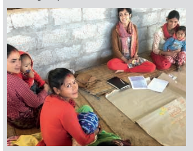
Figure 4, A focus group discussion conducted by the research team with a group of mothers

Community consultations included participatory exercises which were undertaken to facilitate discussion on key areas of the review to obtain views of different members of the group. The picture above shows women documenting ways in which they received information about the project they were participating in, and using smiley face stickers to indicate the different ways in which the implementing agency provided them with information and their preferred way of receiving it.